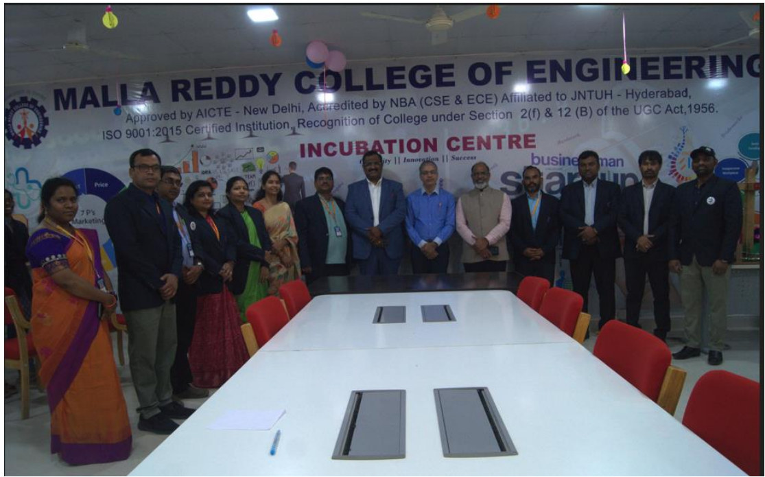
Brief on Startups