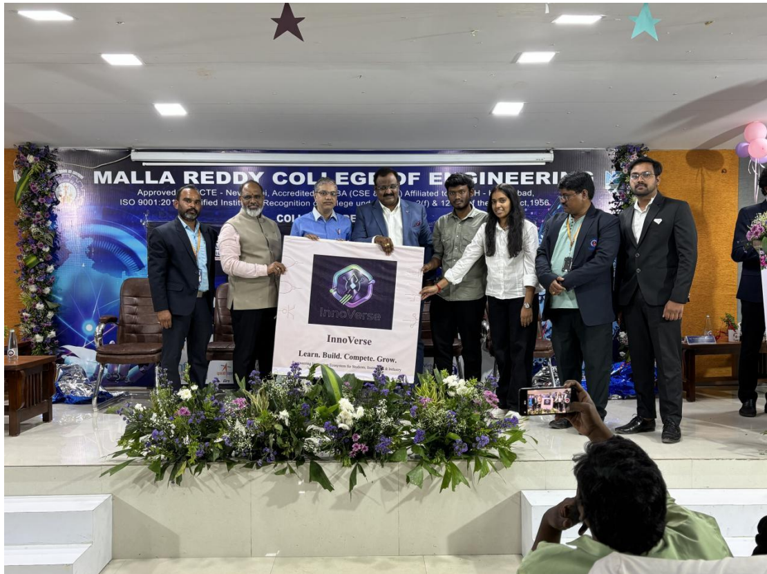
Felicitation of Chief Guest & Guest of Honour