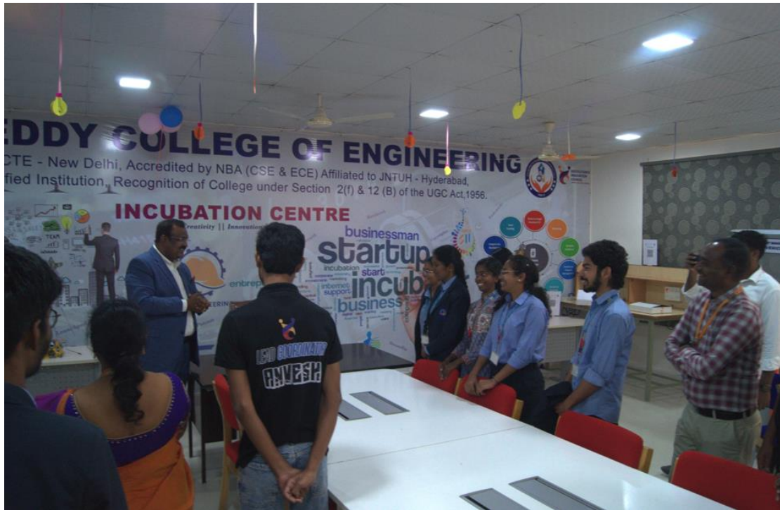
Visiting Of Stalls